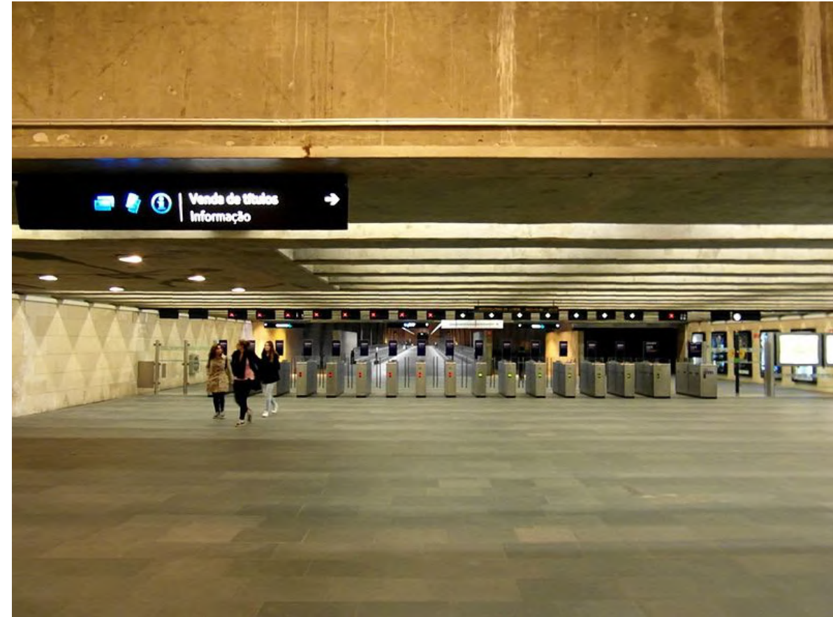
Cais do Sodré Lobby