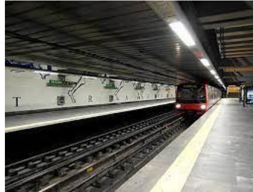
Lobby and Northeast side entrance (trains terminal)